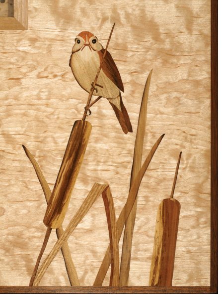
Swamp Sparrow & Cattails, 9" x 12"

Last September, I saw a notice posted that a giant sugar maple in Francestown, NH was broken by Hurricane Irene. The wood was being offered to League of New Hampshire Craftsmen artists. Knowing what a treasure the old tree was, I responded right away. I found several small burls on a damaged limb, removed them with my chainsaw, and